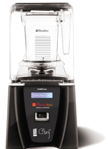
Sound Enclosure Option